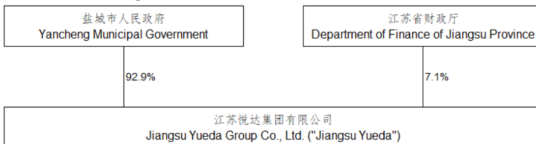
Exhibit 3. Shareholding chart as of 31 March 2025

Source: Company information, CCXAP research