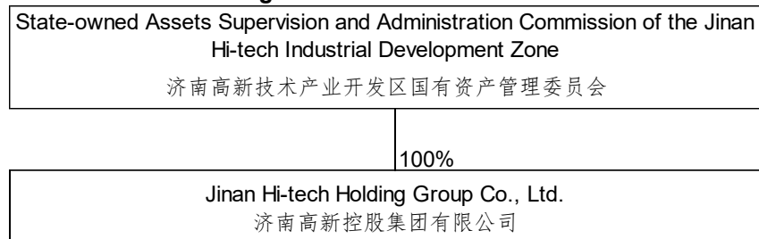
Exhibit 1. Shareholding chart as of end-2024