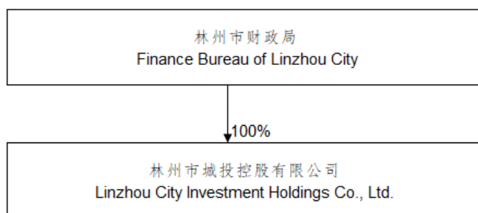
Exhibit 1. Shareholding chart as of 30 June 2025